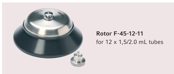
Rotor F-45-12-11 for 12 x 1,5/2.0 mL tubes