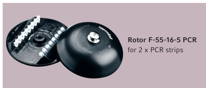
Rotor F-55-16-5 PCR for 2 x PCR strips