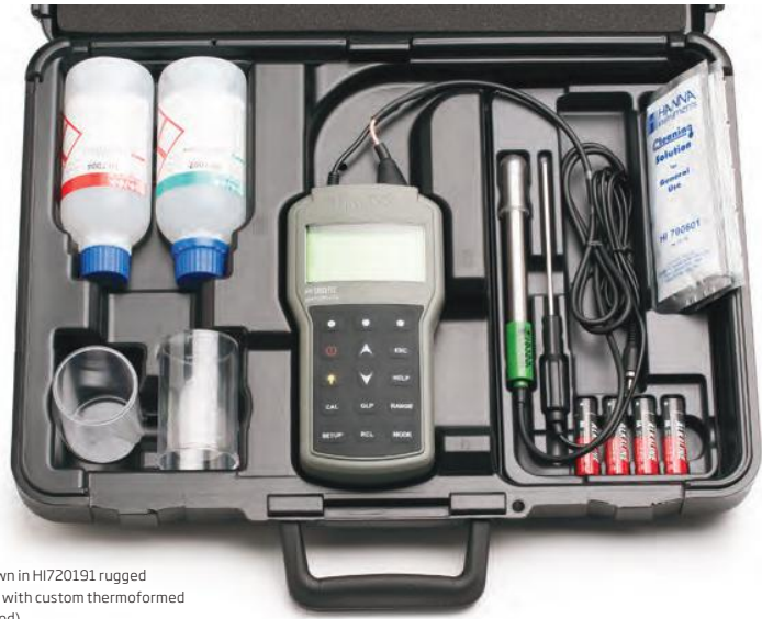
HI98191 shown in HI720191 rugged carrying case with custom thermoformed insert (included)