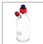
A00000410 Denitrification glass bottle