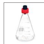
A00000418 Kit Soil Analysis