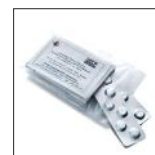
A00000136 Control Test tablets