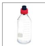
A00000419 Kit plastic biodegradability analysis