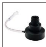
A00000135 Sensor check