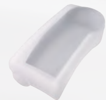
▲ PAL Silicone Cover

◀ Small Volume Sample Adapter for PAL Allows for measurements with a small volume of sample. Place directly on the sample stage.