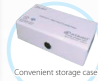
Convenient storage case