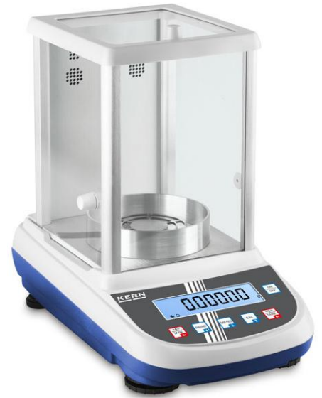
1 KERN ALJ 200-5DA with optional ionisor 2, see Accessories

Analytical balance range with large weighing capacities – now also with EC type approval [M] or available as semi-micro analytical balance