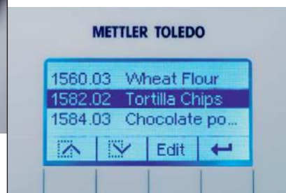
Integrated method library

The integrated method library offers ready-to-use methods for more than 100 substances. Method development becomes simple and fast. All methods are fully tested and compliant to official regulations.