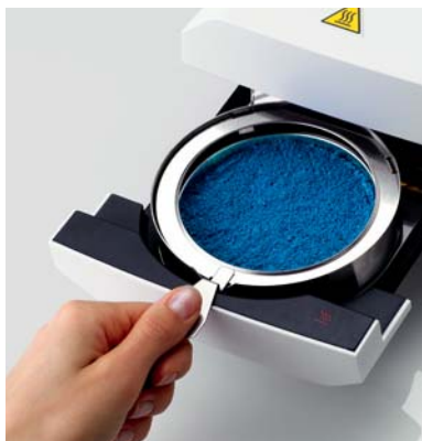
Safe sample handling Automatic drawer Easy operations