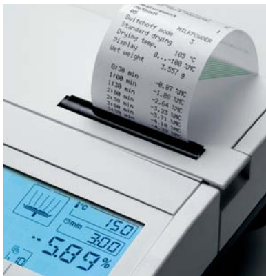
Brilliant display and GLP/GMP compliant protocols

Moisture measurements require just three operator steps: Tare the sample pan, insert the sample and press start. The measurement runs automatically and delivers reliable results within minutes.