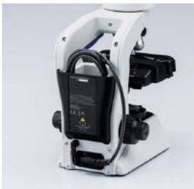
Convenient and easy access power cable storage