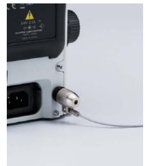
Built-in security slot