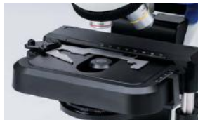
Rackless stage and stage cover