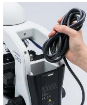
Cable storage compartment