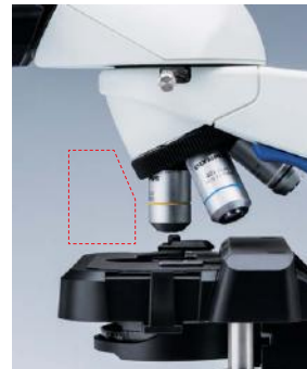
Inward-facing revolving nosepiece