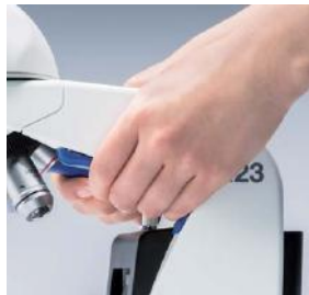
Ergonomic grip for easy carrying