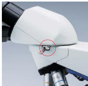
Locking pin for easy binocular rotation