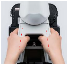
Angled arm enables comfortable carrying