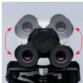
Eyepoint height adjustment