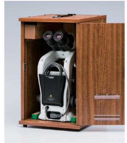
Dedicated wooden case (optional)