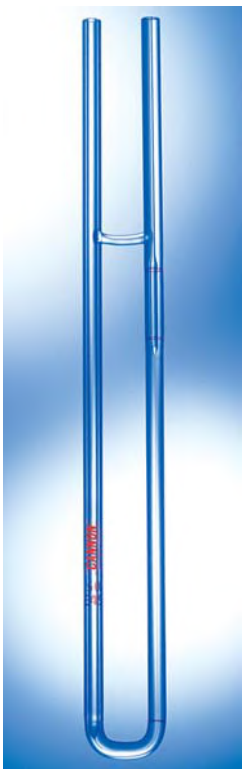
9722-C50 Series 9722-D50 Series