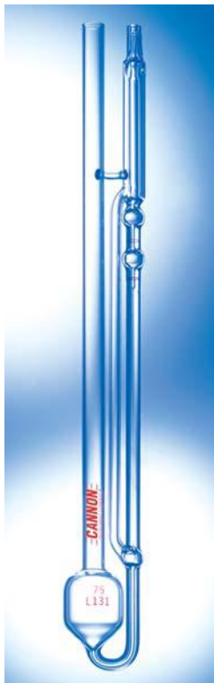
9722-G50 Series 9722-H50 Series