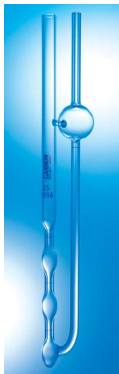
9721-E50 Series 9721-F50 Series