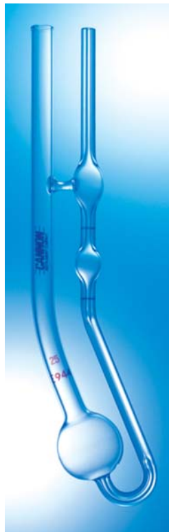
9721-A50 Series 9721-B50 Series