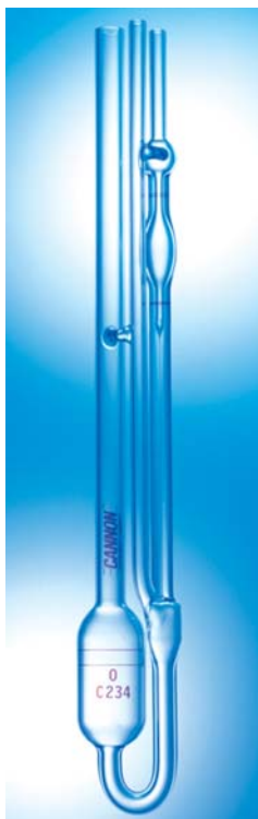
9721-N50 Series 9721-R50 Series 9721-U50 Series