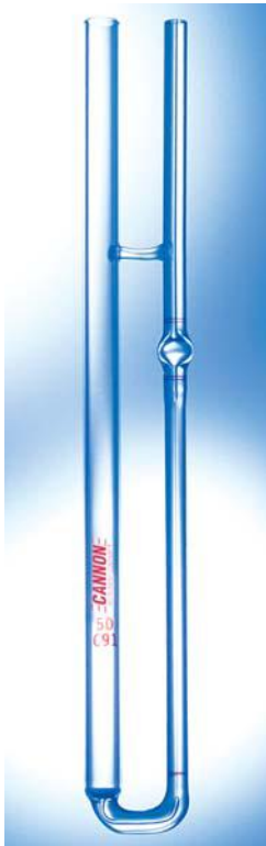
9721-X50 Series 9721-Y50 Series