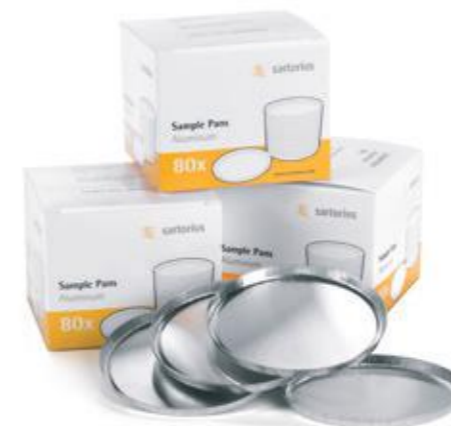
Disposable sample pans